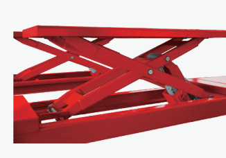
Wheel Free Lift (7700lbs.)