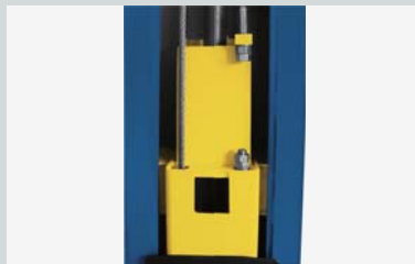
Easier for making both sides work synchronously