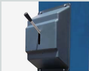
Single Hand-Held Release