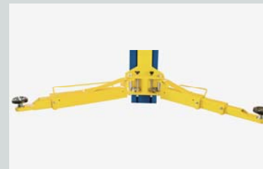
3-Stage Short Arm And 2-Stage Long Arm