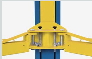
Strong Carriage and Arm Structure