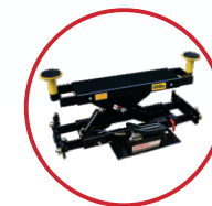
Optional Sliding Jack manual hydraulic type 4,500lbs pneumatic hydraulic type 6,000lbs

DWI Power Systems - www.DWIProSeries.com Home of Pro Series Equipment 130 Commerce Drive Franklin, IN 46131 888-736-5094