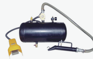
Bead Blaster (PSE-TC900) Optional