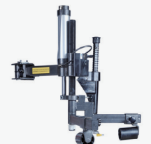
Assistant Arm (PSE-TC900) Optional