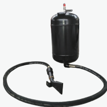
Bead Blaster (TC960, TC983, TC980) Optional