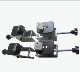
Motorcycle Adapter (TC960, TC983, TC980) Optional