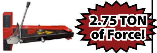
Powerful Pneumatic Bead Breaker

Air Outlets for the JET BLAST compressed air located in each of the clamping jaws makes seating tire beads on wheels very easy!