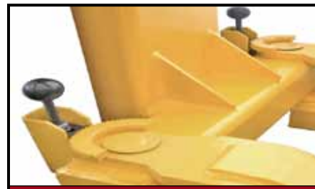
Arm Lock Safeties