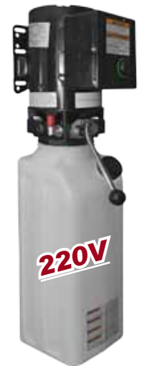
2.5 HP Power Unit