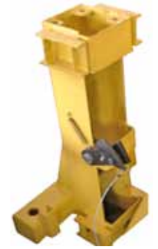
Heavy-Duty Lock System & Carriage