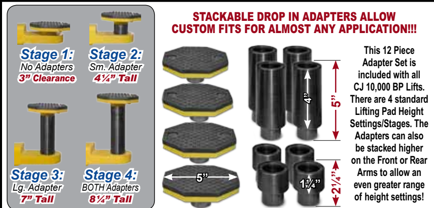
12 Pc. Stackable Adapter | Lifting Pad Kit Included!