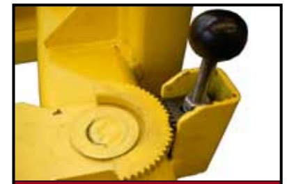
Lock Release Gears