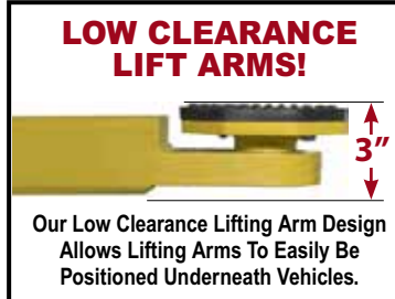
Low Clearance Arms