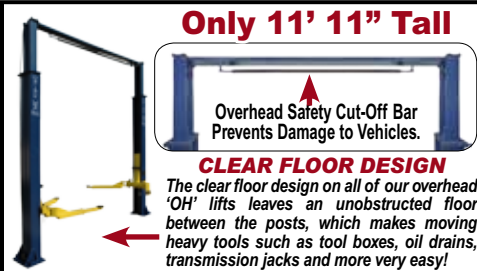
Overhead | Clear Floor Design