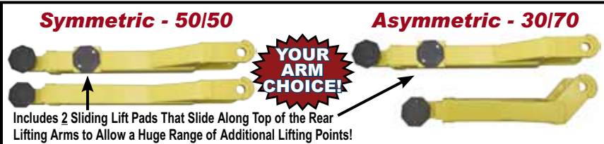
Symmetric OR Asymmetric Lifting Arms