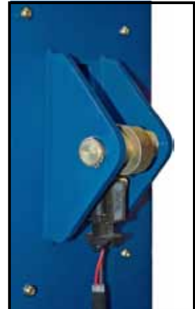
Single Point Lock Release