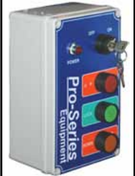
Push Button Controls w/ Key Security