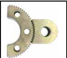
Big Bite Gears