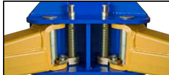
Automatic Arm Release

EXTENDED PROTECTION PLAN: Ask About Our Extended Protection Plan!