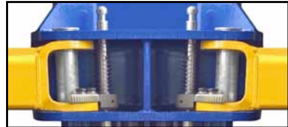
Automatic Arm Release