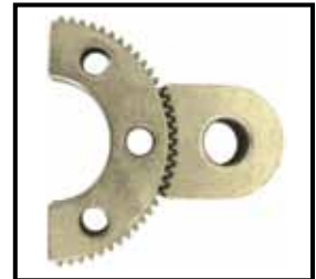
Big Bite Gears