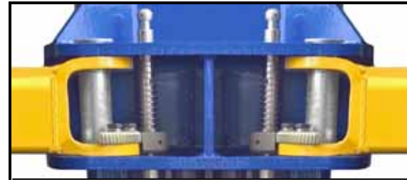
Automatic Arm Release