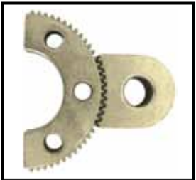
Big Bite Gears