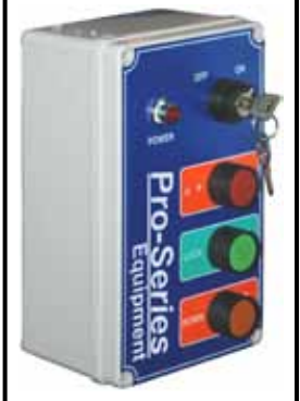
Push Button Controls w/ Key Security